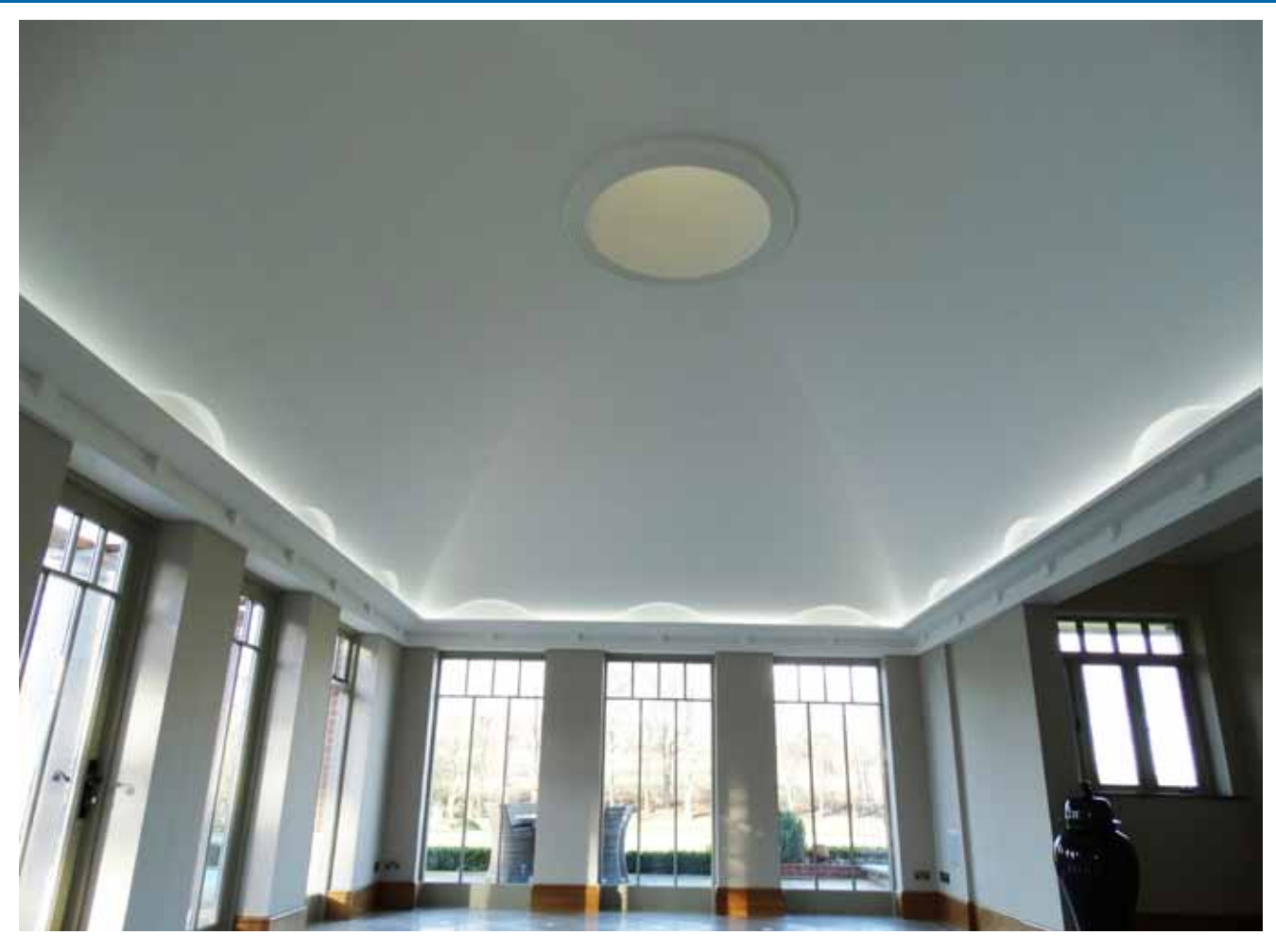
High Precision Solid Plastering in Private Residence