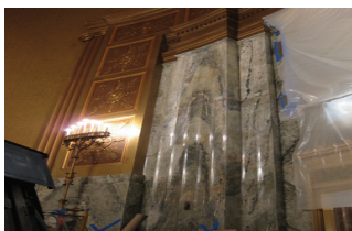
Organic Scagliola in Beacon Theatre Rotunda Lobby