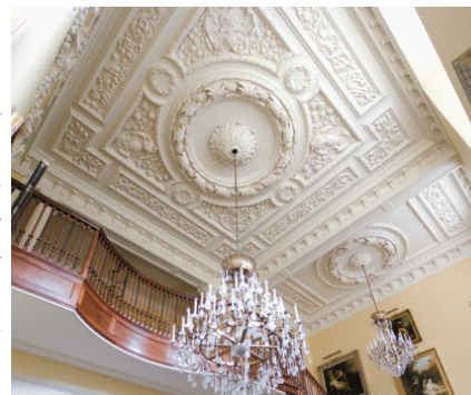
Private Residence - Strapwork Ceiling designed, modeled and manufactured by the UK team in 2007.