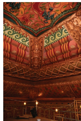
The Beacon Theatre Ceiling

The work that Hayles and Howe, Inc. included the Scagliola featured on page 2. The effect is really incredible and congratulations to all the team in the USA.